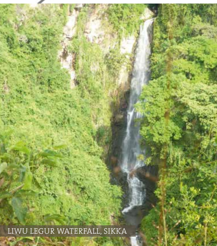
LIWU LEGUR WATERFALL, SIKKA

5-STAR AIRLINE Garuda Indonesia The Airline of Indonesia