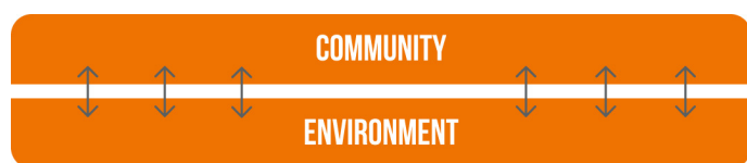
Figure 1: The structures at the core of a healthy entrepreneurial ecosystem.