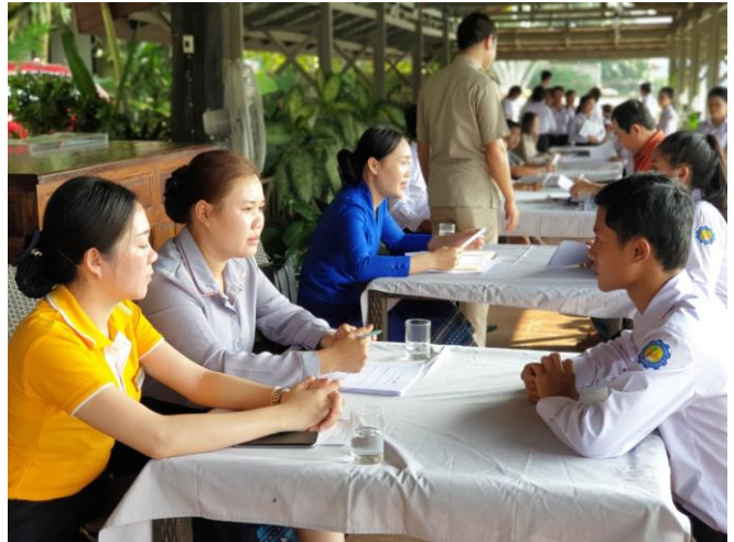
Image: PTHAS Job-matching event at Somphan's Hotel in Vangvieng.