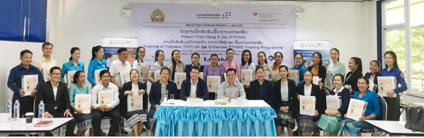
Image: Training of Trainers Completion Ceremony for TVET teachers at the former Lanith, Vientiane.

PTHAS places a high importance on preparing students for work in the private sector. Teachers arrange industry days and internships, and counsel students in collaboration with local businesses.