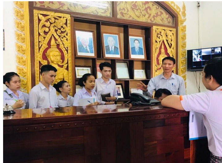
Image: Industry day at a hotel in Pakse, Champasak Province. Students receive a practical introduction to front office operations.